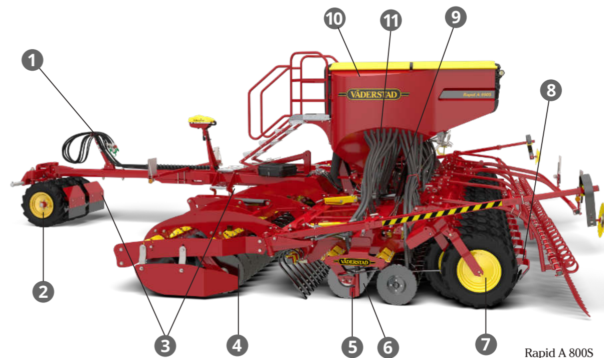
Rapid A 800S

Safety! Carefully read the safety instructions in the instruction manual before any service or maintenance work is carried out. Lubricate according to schedule.